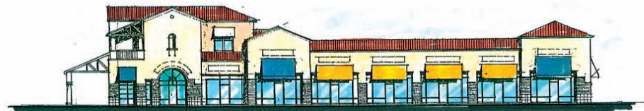
BUILDING 'C' ELEVATION

The warmth of the sun. The colors of Tuscany. The intimacy of a village. Reata Ridge Village combines all of the best elements of a mixed-use experience: attention to detail, rich amenities, thoughtful co-tenancy, and a true shop, live, work, and play destination in a warm, village setting in Parker, Colorado.