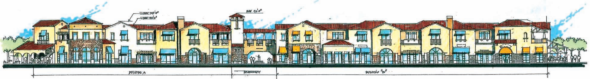
BUILDINGS 'A' AND 'B' ELEVATION

NEC Parker Road & Stroh Road Parker, Colorado